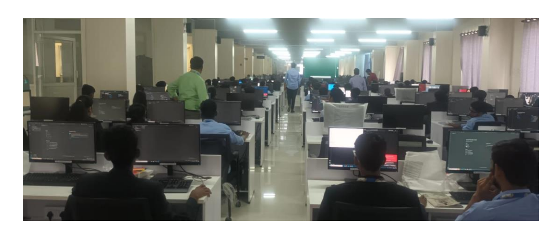
07/03/2024, 1: 20PM-3:50PM (CSE(AI&ML)-B ,C & IT-C: Room No.7310)