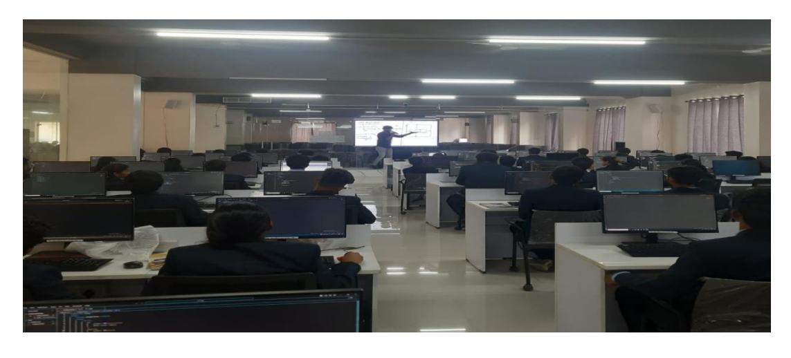
07/03/2024, 9:20AM-11:50 AM-(CSG: Room No.7310)