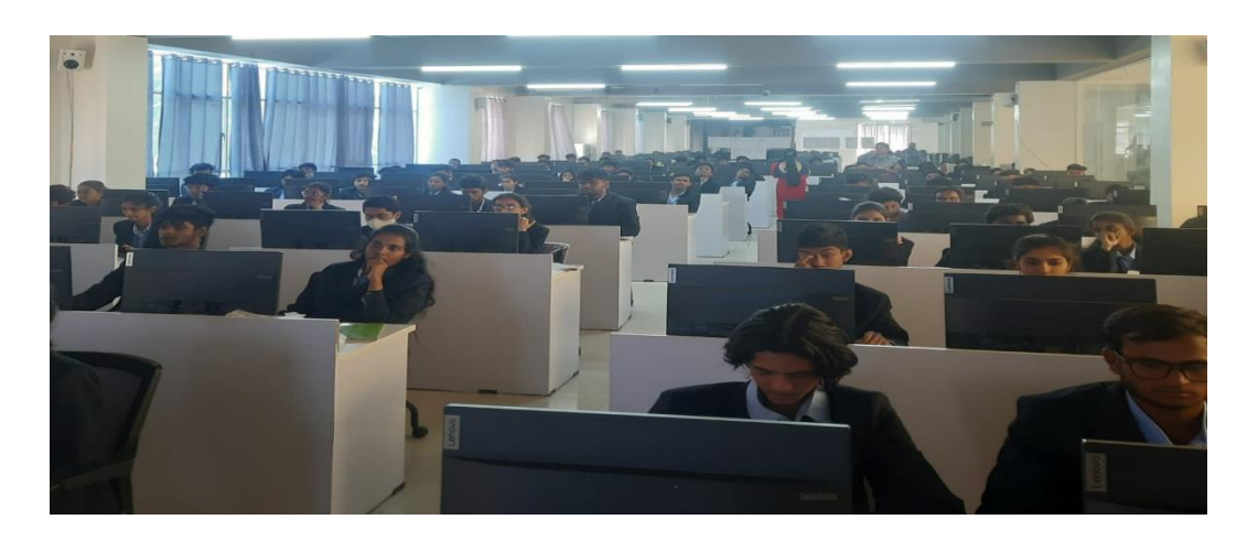
07/03/2024, 1:20PM-3:50PM (CSE(AI&ML)- A& B IT- C: Room No.7113)