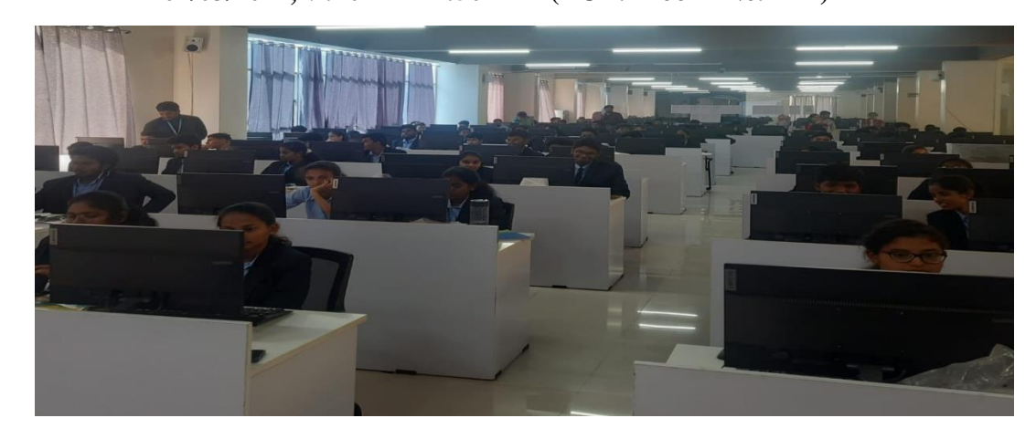
07/03/2024, 9:20AM-11:50 AM-(AI&ML, EEE Room No.7113)